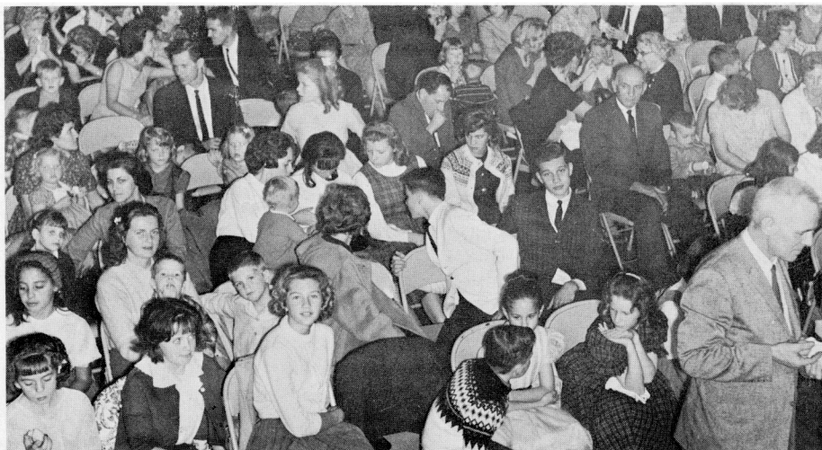
Part of the crowd--sitting pretty!

However, keep a date open for February 9, for the next event. Details will be announced later.