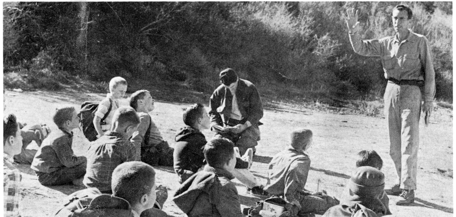
Five miles to go!!!

The final assembly at Verdugo Park revealed 20 tired boys and their leaders were victorious and triumphant over 110 fish.